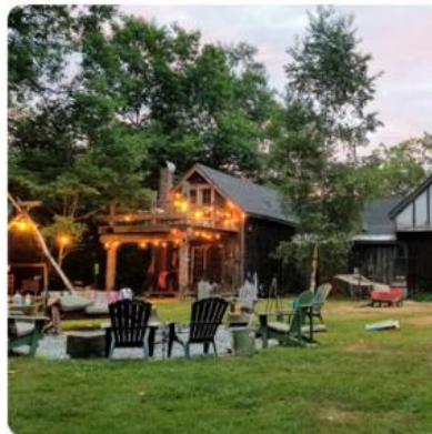
Home Back Up Electricity