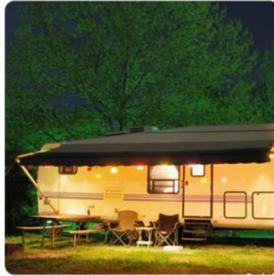
RV Energy Storage