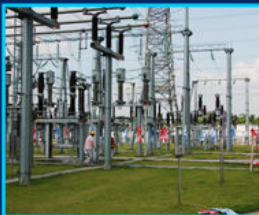
Power Station energy storage