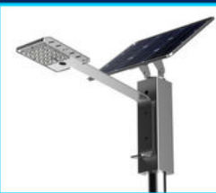
Solar Street Lighth