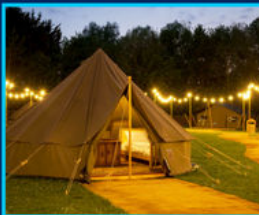
Household energy storage