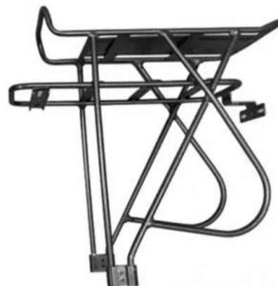
26 inch to 28 inch wheel mounted