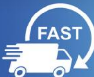
3-7 Days Swift Delivery