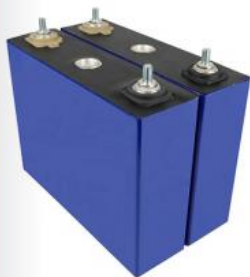
Lifepo4 battery 3.2V 304A