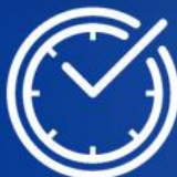
24 Hours Online Support