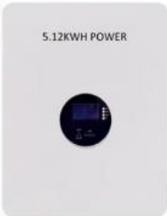
Solar LiFePO4 B5.12KW 51.2V 100Ah 200Ah atttery