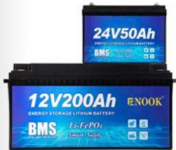
12V & 24V SERIES ENERGY STORAGE LITHIUM BATTERY