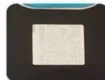
Complete QR Code