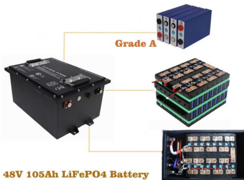
48V 105Ah LiFePO4 Battery